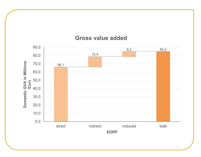
Figure 2: Estimated Gross Value Added induced by the EDRP and EDIDP in Austria